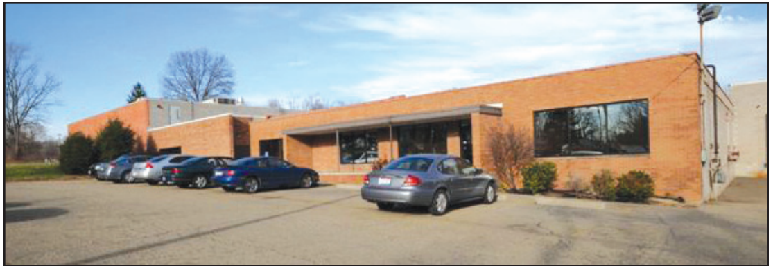
Warren Screw Machine now occupies this building at 3869 Niles Road in Warren.

WARREN - First Place Bank and an SBA 504 Loan have made it possible for Warren Screw Machine to move into a new facility. Now located in the former Berk Enterprise Building at 3869 Niles Road in Warren, Warren Screw Machine was founded in 1950. For its first thirty-four years, the business offered secondary and general machine shop work.