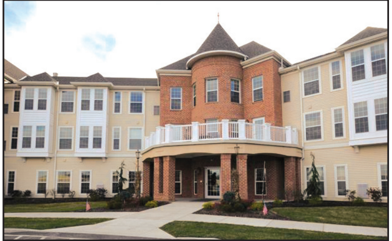
Hampton Woods has added an Assisted Living facility on Western Reserve Road in Poland.

POLAND - Kathleen Prasad has expanded capacity at her Hampton Woods Nursing Center, with the addition of an Assisted Living facility. The 52 unit facility was constructed adjacent to the current building and is connected via a walkway. The Assisted Living Center serves individuals who may need assistance with medication and personal care activities, but not the round-the-clock care a nursing facility provides.